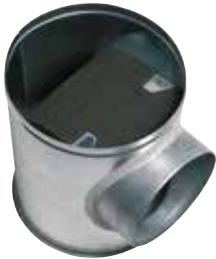
Acoustic and Aeraulic T-piece branch connector

The CP2A aluminium branch connector provides a junction and accessibility to the vertical collector system and horizontal ducting, while improving acoustic and aeraulic performance.