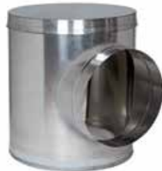
Acoustic and Aeraulic T-piece branch connector