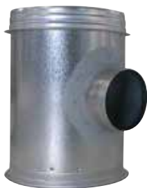
Caisson Piquage pour relevé d'étanchéité

The CPT T-piece branch connector for air tightness readings creates a junction and access point for the vertical collector system and the horizontal ducting.