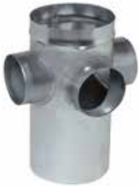
Storey collector connection (CRE) standard

The CRE standard storey manifold is used to connect up to four 125 mm diameter ducts to the vertical riser.