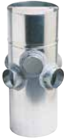
Collecteur Raccord d'Etage multilogement

The multi-dwelling CRE storey manifold can connect two dwellings on the same storey to the same vertical riser.