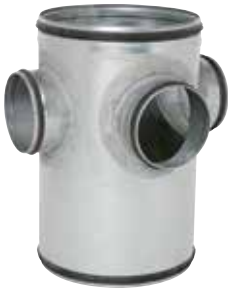
Storey collector connection with seals (CRE)

The CRE sealed storey manifold is used to connect up to three 125 mm diameter ducts to the vertical riser while delivering class C airtight performance.