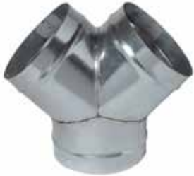
Culotte Simple 90°

The 90° Y-piece enables confluence of 2 galvanised duct branches at 90° from each other.