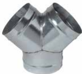
Culotte Simple 90°

The 90° Y-piece enables confluence of 2 galvanised duct branches at 90° from each other.