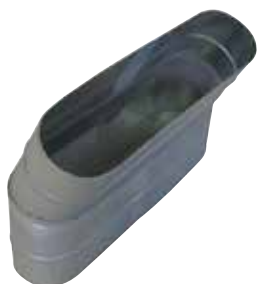
30° bend oblong vertical

The Oblong vertical 30° bend is used to change the direction of an oblong ducting system by a 30° angle.