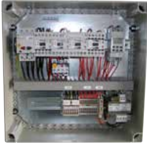
Smoke and heat exhaust system for multi-occupancy

The residential car park smoke and heat exhaust units control the 2-speed axial fans for ventilation, smoke and heat exhaust.