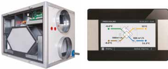
DFE Remote control

DFE® Micro-Watt is a affordable compact counterflow unit for small rooms, that deliver good indoor air and have a simple automatic.