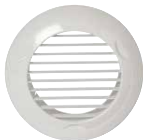
BIP D 80 and D 125 mm grille

BIP and BIO and fixed ventilation grilles for individual houses and multi-occupancy housing.