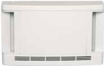
EHT/EFT² humidity-controlled air inlet

EHT is a humidity-controlled air inlet for wall penetrations in single-family dwellings and multi-occupancy buildings.