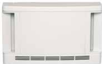
EHT/EFT 2 humidity-controlled air inlet

EHT is a humidity-controlled air inlet for wall penetrations in single-family dwellings and multi-occupancy buildings.