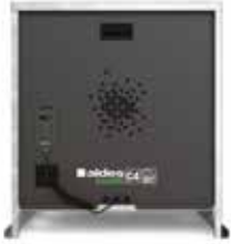
EasyVEC C4 Micro-watt 5000 to 12000

The best-designed range of exhaust box fans on the market, making ventilation efficient, serene, and easy.