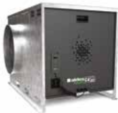
EasyVEC C4 Micro-watt + 5000 to 12000

The best-designed range of exhaust box fans on the market, making ventilation efficient, serene, and easy.