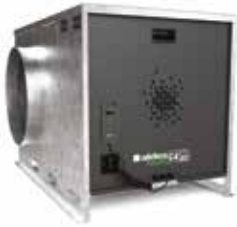
EasyVEC C4 Micro-watt + 5000 to 12000

The best-designed range of exhaust box fans on the market, making ventilation efficient, serene, and easy.