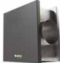
EasyVEC Compact 3000 1V