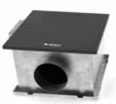
EasyVEC Compact 3000 1V

The best-designed range of exhaust box fans on the market, making ventilation efficient, serene, and easy.