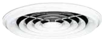
SC 831 diffuser

The SC 831 is a steel concentric circular diffuser for fixed-rate air diffusion and horizontal airflow.