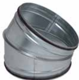
30 pressed bend + seal

The sealed 30° bend is used to change the direction of a galvanised ducting system by a 30° angle while delivering class C airtight performance.