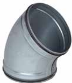
45 pressed bend + seal

The sealed 45° bend is used to change the direction of a galvanised ducting system by a 45° angle while delivering class C airtight performance.