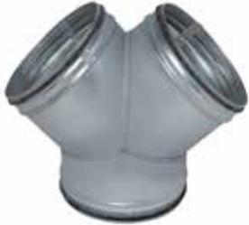
Single Y-piece 90 with seal

The sealed 90° Y-piece enables confluence of 2 galvanised duct branches at 90° from each other, while delivering class C airtight performance.