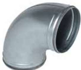
90 pressed bend + seal

The sealed 90° bend is used to change the direction of a galvanised ducting system by a 90° angle while delivering class C airtight performance.