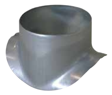
Piquage Equerre Circulaire 90°

The PEC circular 90° branch connector makes a right-angle branch on a galvanised circular duct.