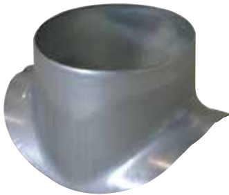
Piquage Equerre Circulaire 90°

The PEC circular 90° branch connector makes a right-angle branch on a galvanised circular duct.