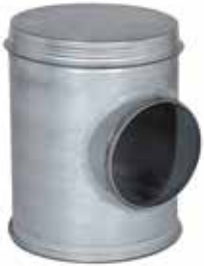
Acoustic and Aeraulic T-piece branch connector with seals

The sealed CP2A branch connector provides a junction and accessibility to the vertical collector system and horizontal ducting, improves acoustic and aeraulic performance, while delivering class C airtight performance.