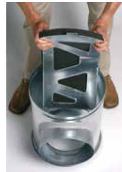
Installation du déflecteur acoustique et aéraulique dans le caisson piquage