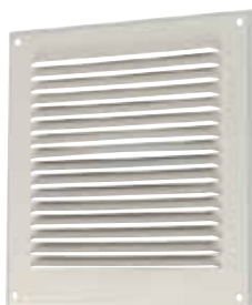
Grille métallique GAT

GAT-GR are metal ventilation grilles for individual houses and multi-occupancy housing.