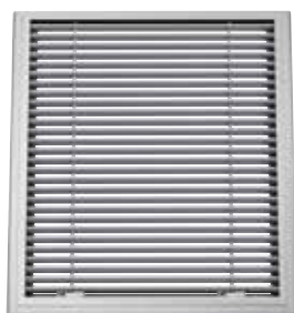
Grille GFAP 007

The GFAP 007 decorative grille serves to conceal openings or smoke control dampers.