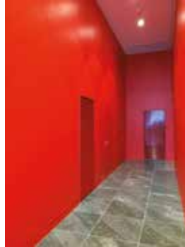
Grille GGH esthétique installée dans un couloir