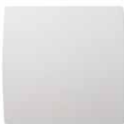
GRAPHIC front view