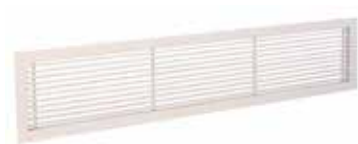
Grille Gridlined wall

GRIDLINED Wall is an aluminium fixed wall grille for indoor air supply and extraction in commercial buildings.