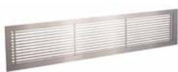
Grille Gridlined wall

GRIDLINED Wall is an aluminium fixed wall grille for indoor air supply and extraction in commercial buildings.