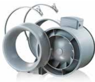
Removable motor unit