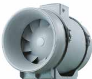
IN LINE XPro

IN LINE XPro is an energy-efficient, high-performance duct fan. Its removable motor unit makes installation and maintenance easy.