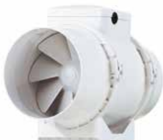
IN LINE XS

IN LINE XS is a compact duct fan for one or more rooms. Its removable motor unit makes installation and maintenance easy.