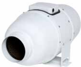
IN LINE XSilent

IN LINE XSilent is a very quiet, high-performance duct fan with a steel casing and 50 mm internal acoustic insulation.