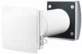
Nano Air 50

The heat recovery ventilation solution for individual rooms, which combine healthier air, preservation of the building and savings on heating costs.