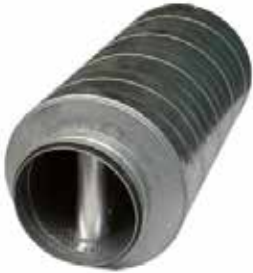
Octa à baffle diamètre 630 à joint

The OCTA with baffle sound attenuator strongly attenuates mid and high-frequency acoustic propagation in circular ducting.