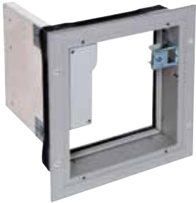
OPTONE «Classic» 1-flap open

OPTONE «Classic» smoke control dampers are intended for commercial premises and can be used as air inlets or for smoke and heat exhaust.