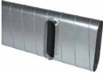
Oblong Branch Connector on flat section

The PDOP oblong 90° branch connector for flat section makes a right-angle branch on a galvanised oblong or rectangular duct.