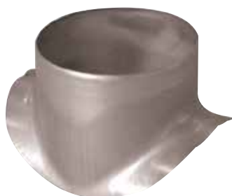
Piquage Equerre Circulaire en aluminium

The PEC aluminium circular 90° branch connector makes a right-angle branch on an aluminium circular duct.