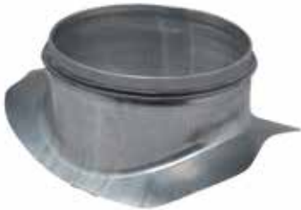
Sealed circular 90 branch connector

The PEC sealed circular 90° branch connector makes a right-angle branch on a galvanised circular duct.