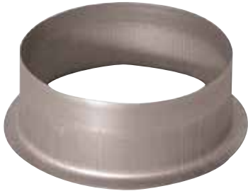
Piquage Equerre sur Plat en aluminium

The PEP aluminium flat 90° branch connector makes a right-angle branch on an aluminium rectangular duct.