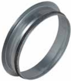
Sealed flat right angle connector

The PEP sealed flat 90° branch connector makes a right-angle branch on a galvanised oblong or rectangular duct.