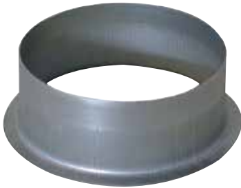
Piquage Equerre sur Plat 90°

The PEP flat 90° branch connector makes a right-angle branch on a galvanised oblong or rectangular duct.