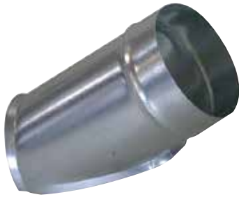
Piquage Oblique Circulaire 45°

The PEC circular branch connector makes a 45° angle branch on a galvanised circular duct.