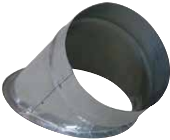
Piquage Oblique sur Plat 45°

The POP angled branch connector makes a 45° angle branch on a galvanised oblong or rectangular duct.