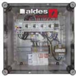
ParkONE car park smoke and heat exhaust system for multi-

The residential car park smoke and heat exhaust units control the 2-speed axial fans for ventilation, smoke and heat exhaust.