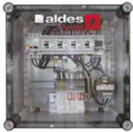
ParkONE car park smoke and heat exhaust system for multi-

The residential car park smoke and heat exhaust units control the 2-speed axial fans for ventilation, smoke and heat exhaust.