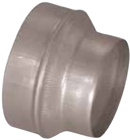
Réduction Conique Concentrique en aluminium

The RCC aluminium joins two aluminium ducts of different diameters together.