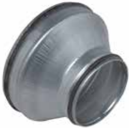
Concentric Conical Reducer

The sealed RCC concentric conical reducer is used to join two galvanised ducts of different diameters together while delivering class C airtight performance.